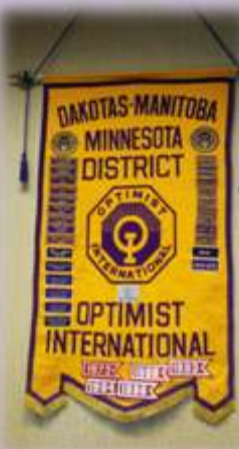
Our host District showed their pride & optimism