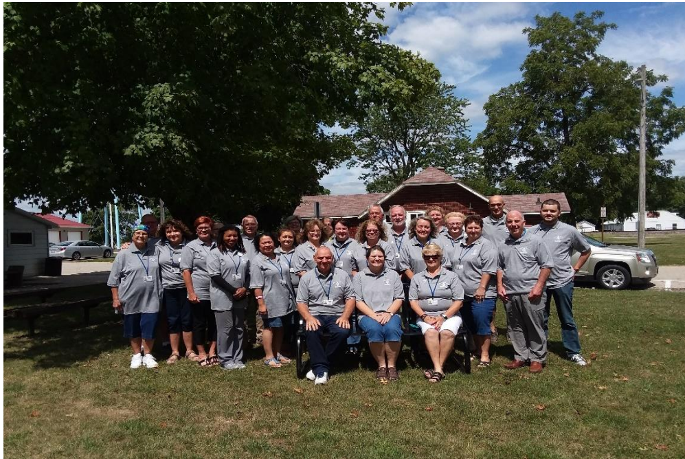
Team Picture at Governor's Retreat in Danville, Iowa (August 2019)