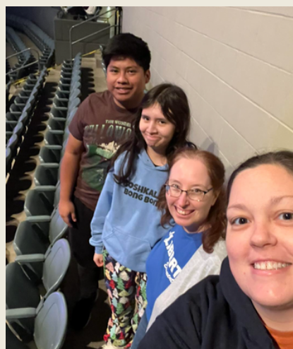
Manna Cares celebrating Optimist Day!