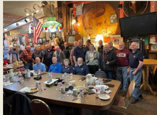
Shenendoah Optimist group sporting their new club shirts